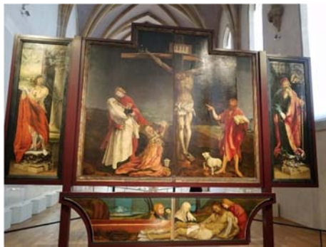
Figure 1. The Isenheim altarpiece in Musée Unterlinden, Colmar. The frontal altar depicts the Crucifixion of Jesus Christ. The Virgin is comforted by Johan the Evangelist. Johan the Baptist is pointing at Jesus with a long finger. At the left Saint Sebastian and at the right Saint Anthony are standing. In the predella the Entombment of Jesus is witnessed by Johan the Evangelist, the Virgin and Maria Magdalena.

In the predella , the foot piece of the altar, the Entombment is depicted. The Virgin hides her tears behind a veil, and a weeping red-eyed Maria Magdalene witnesses the event.