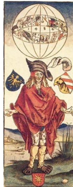
Figure 4. A young man with syphilis dressed in elegant French clothes referring to "The French disease". His pants are down to show the "Böse blattern". It is the first known realistic picture of syphilis in its original malignant form. The woodcut is attributed to Albrecht Dürer and dates from 1496 (Wellcome Collection).

The right panel of the back part of the altar depicts Saint Anthony's temptation in the desert. It is inspired by a woodcut from 1511 by Hans Baldung Grien (1484-1545) entitled "The seven deadly sins". It shows devils each representing one of the mortal sins. The pauvre monk sitting in the corner (Figure 2) is placed just as the devil representing gluttony ("fressery") [6] (Figure 5).