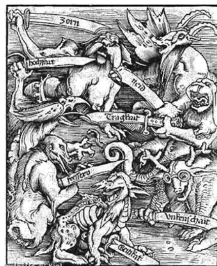
Figure 5. "The seven deadly sins" by Hans Baldung Grien, showing a demon representing gluttony placed in the corner just as the deploring anthonite monk of Figure 2.