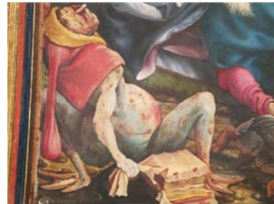
Figure 2. In the right side-panel of the back alter a shabby detronised anthonite monk is sitting. He has sores and boils suggestive of "böse Blattern", malignant syphilis, and a swollen belly (Angelica Rogers).

apostles sitting at a table, Jesus in the middle as the largest. He holds a globus cruciger , a globe with a cross, the sign of Savior of the world [1].